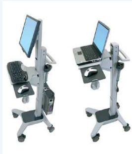
Neo-Flex mobile workspace from Online Ergonomics

Online Ergonomics have joined the Ergonomics Consortium as a Supplier Member and have agreed to offer a 10% discount to all other Members and their Customers.